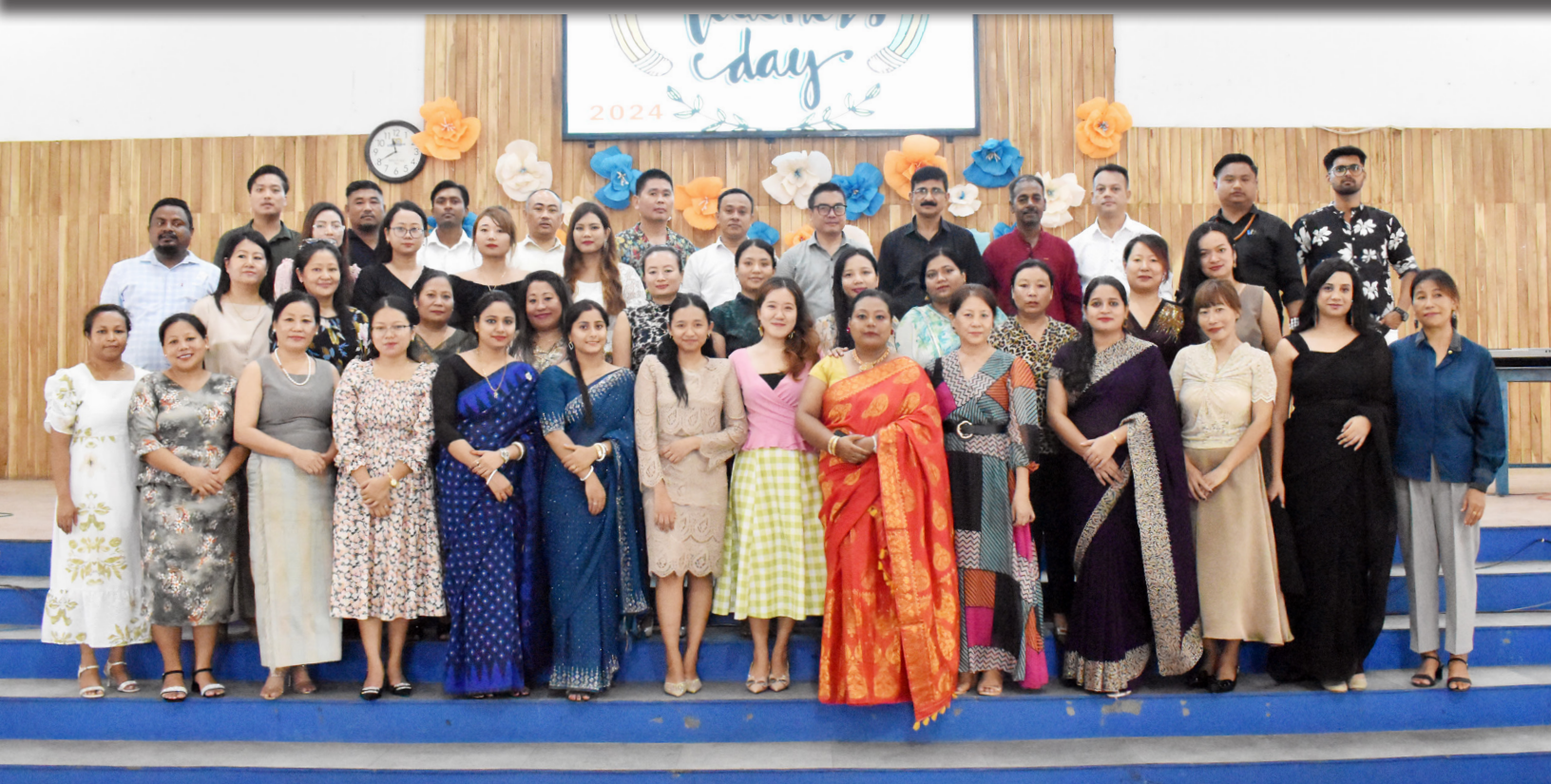
HIGH SCHOOL TEACHERS